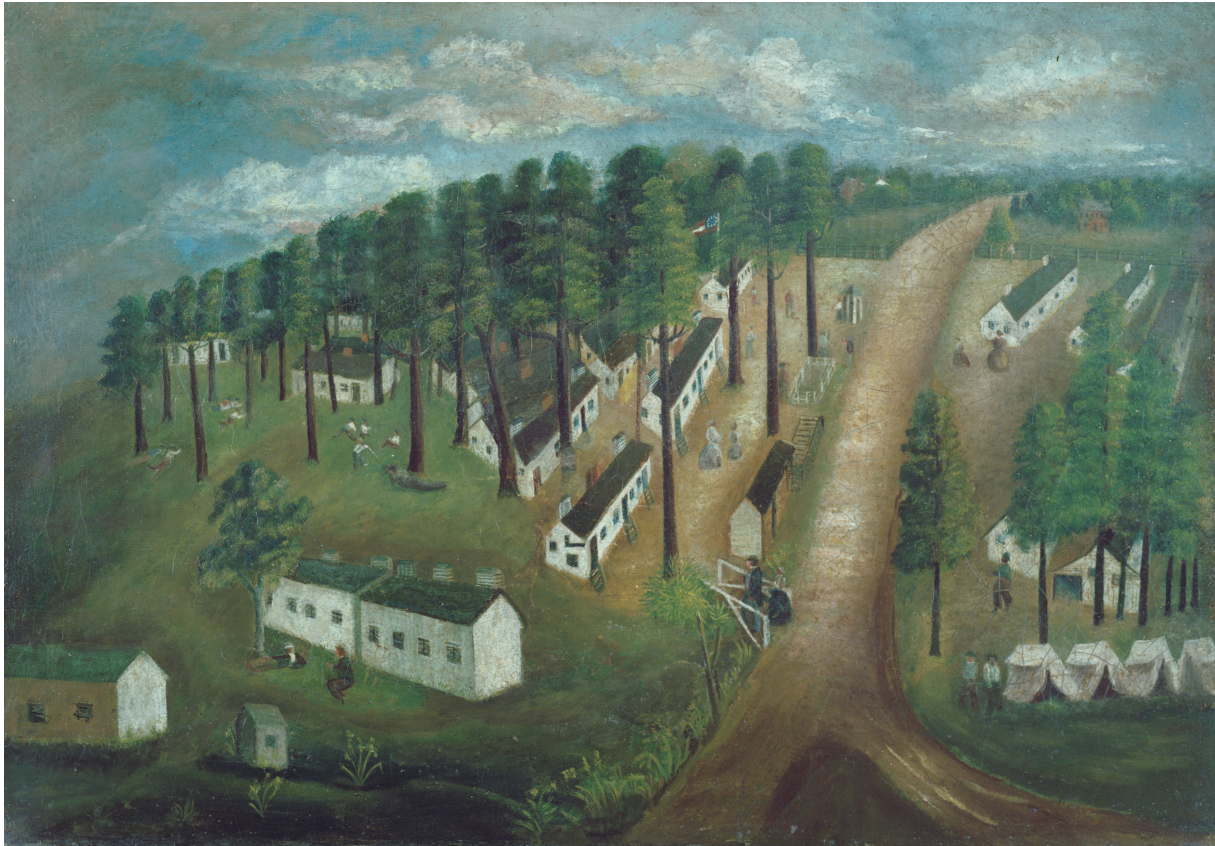
Image Two: A Civil War era oil painting of the military section of Howard's Grove Hospital. Although this image does not show the small pox hospital that became Central Lunatic Asylum, the image reflects the architectural style of barracks the asylum acquired in 1869. Unknown Artist, Howard's Grove Hospital , 1863-1865, oil on canvas, The Chicago History Museum.

Following the Civil War, the Small Pox Hospital for Negroes at Howard's Grove was taken over by the Freedmen's Bureau and renamed Howard's Grove Freedmen's Hospital. The Virginia Freedmen's Bureau was headquartered in Richmond and its earliest efforts were dedicated to providing food, clothing, and medical care to destitute freedmen. 148 The barracks that comprised the former small pox ward, already outfitted as a hospital dedicated to caring for